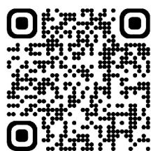
e2i AI Interviewer