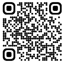
e2i AI Resume Builder